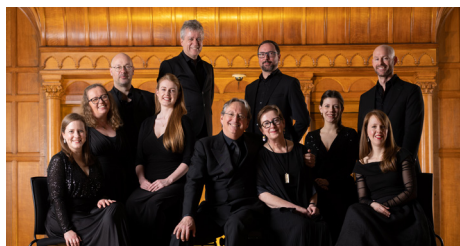
The Tallis Scholars Tuesday, Dec. 9 at 7:30 p.m. St. Joseph Catholic Church