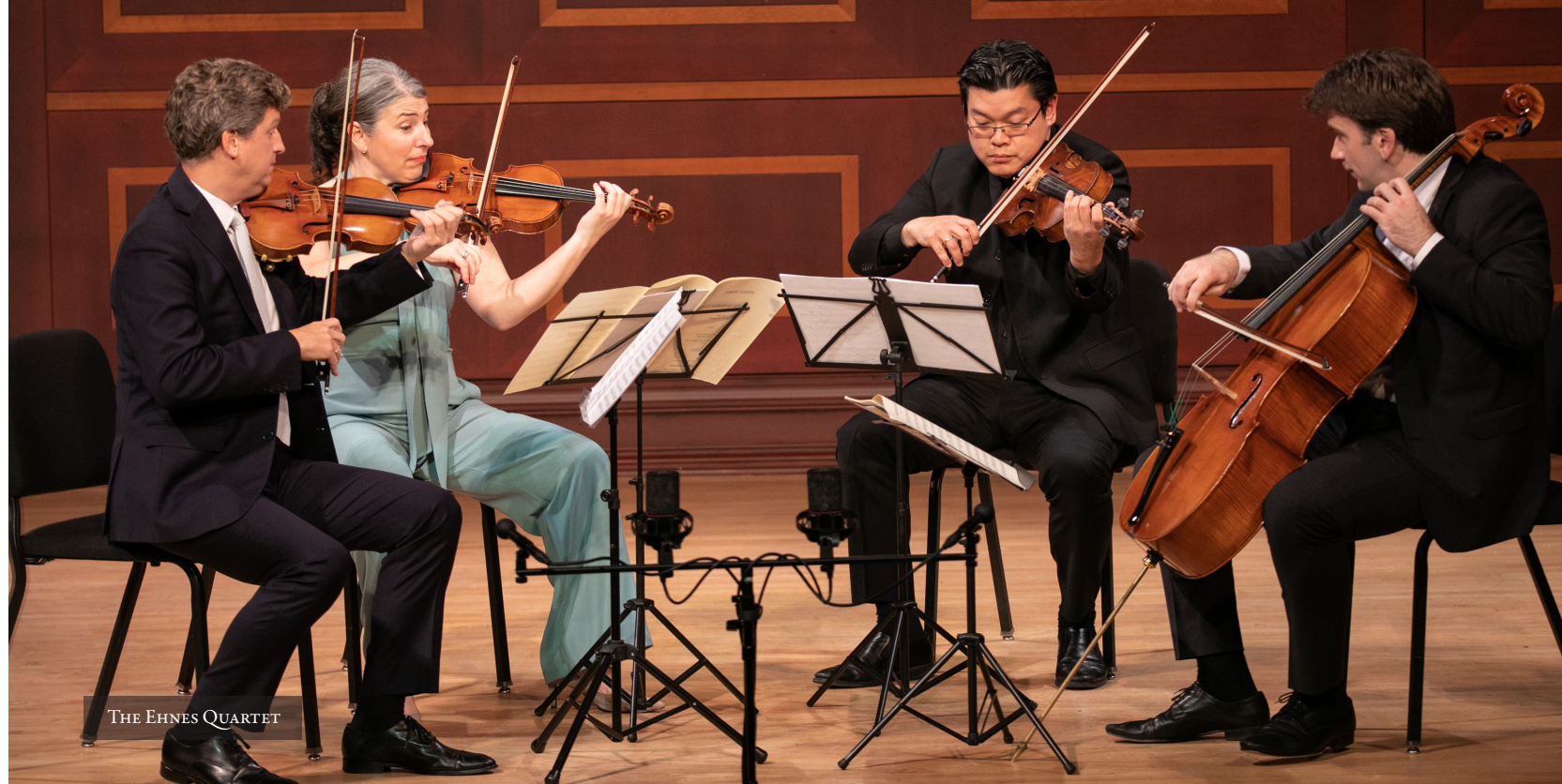
THE EHNES QUARTET