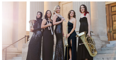
Seraph Brass Thursday, Feb. 5 at 7:30 p.m.